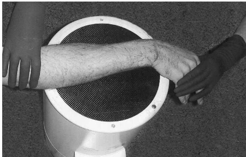
Fig. 2. Position of the surgeon's hands in relation to the image intensifier during forearm manipulation.

When using an image intensifier a surgeon's hands can be exposed both directly from the primary X-ray beam and secondly from scattered radiation reflected from the patient. The scattered radiation dose is determined by the distance from the source [4] and increases as the area irradiated increases. Arnstein et al. [1] showed the dose to the surgeon's